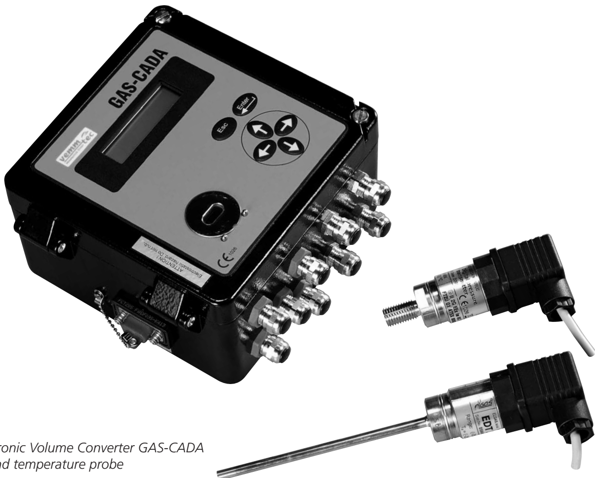
High Level Electronic Volume Converter GAS-CADA with pressure and temperature probe